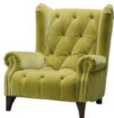
OSSIE CHAIR SHOWN IN BIBA MUSTARD FABRIC WITH GOLD STUDS