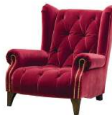
OSSIE CHAIR SHOWN IN BIBA BERRY FABRIC WITH GOLD STUDS